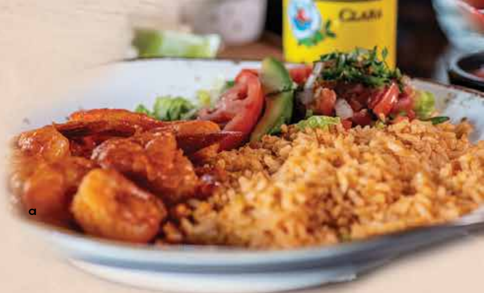
camarones a la diablo

Marinated and charbroiled in special sauce, served with rice, beans and tortillas 31.99