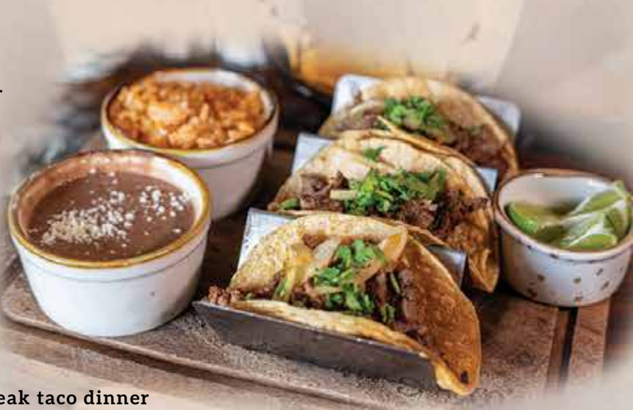
steak taco dinner

Filled with choice of seasoned ground beef, shredded beef or shredded chicken. Topped with tomato sauce, sour cream, cheese and lettuce. Served with rice and refried beans 14.99 Made with Grilled Steak or Grilled Chicken, add 2.00